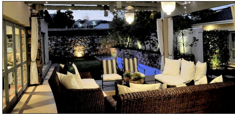
The Parkwood relaxation area

sume that most of the other guests there were in town on business – they seemed to be at home; some were relaxing in the plush common lounge while I spotted others working on their laptops over a drink... there is an honesty bar, allowing you to drink as much as you want, as long as you make a note of what you've had.